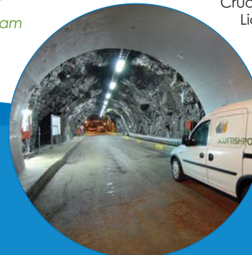
Access to the turbine hall is through a 1km tunnel

Reached by a tunnel about seven metres wide and four metres high, the main cavern houses four generator/motor sets that are capable of generating 440 megawatts (MW) of electricity – enough to supply more than 225,000 homes. The cavern is also home to the transformer halls, a viewing gallery for visitors and a computerised control room from which the plant is monitored and controlled.