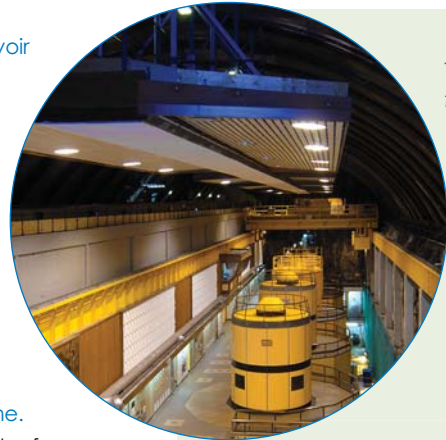
The station's machine hall, containing the four turbines, is the same size as a football pitch