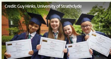
Children's University Scotland: Children's University Scotland