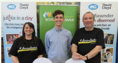
Theatr Clwyd: Justice in a Day