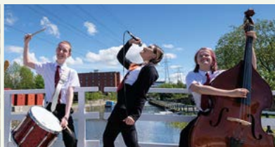
National Theatre of Scotland: Submarine Time Machine