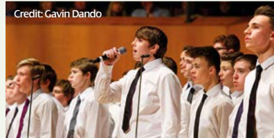
The Aloud Charity: Only Boys Aloud – North Wales Activity