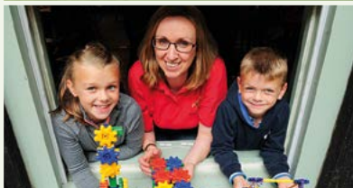
Dumfries House: Engineering Education Programme