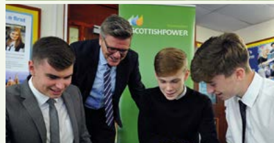
Young Enterprise – England: Journey to Success