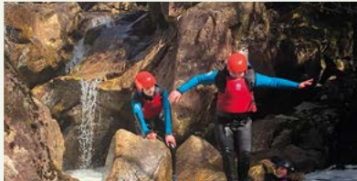
The Outward Bound Trust: Young Carers Together