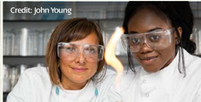
Glasgow Caledonian University: Advanced Higher Hub