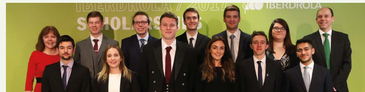
ScottishPower Foundation Scholarships: Masters in Energy & Environment