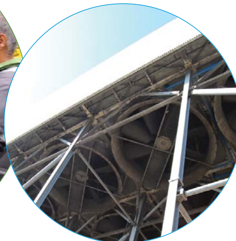
The air-cooled condenser