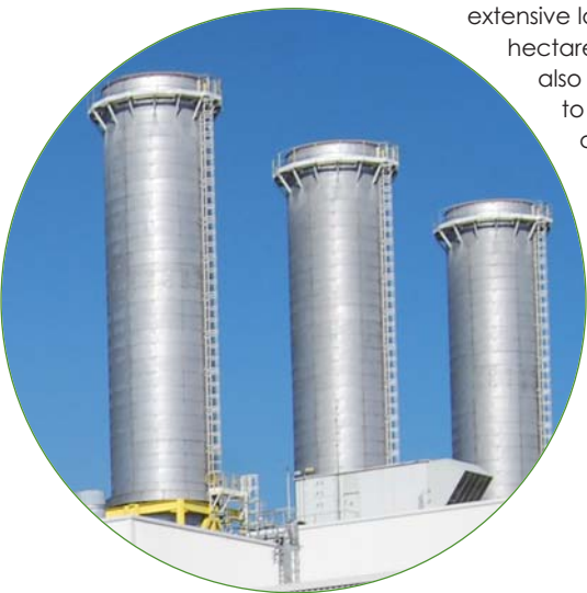
Rye House's distinctive triple stack

Rye House has an excellent track record of environmental compliance and enjoys a positive relationship with its neighbours, actively participating in community life.