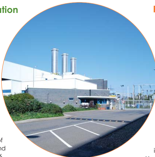
CCGTs like Ryehouse are very efficient

water required for the generating process – the use of cooling towers for Rye House would have required a million gallons of river water to be extracted each day. The ACC was increased in size by 10% in 2006 to improve its efficiency, especially in warm weather. Low-noise fans were also installed to reduce the impact on local communities.